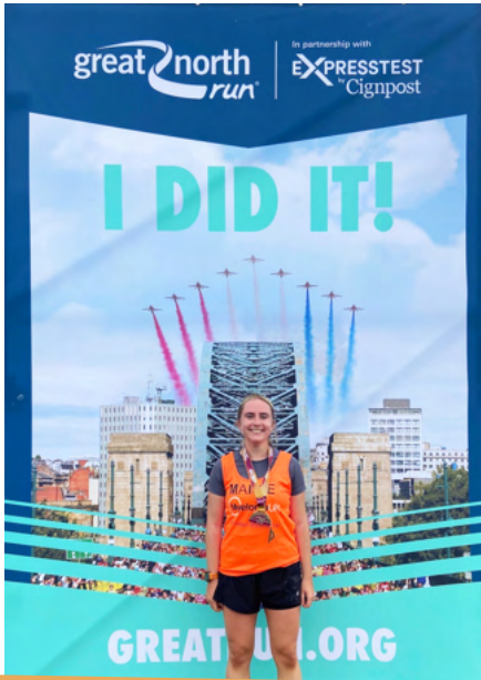
Me, after doing the Great North run in 2021

Finally, thanks to a friend's help with NHS Self-Help, I got a referral to Beechwood, which has truly been a blessing. I visited the site, but it was just a little far via public transport, so I inquired about the possibility of online counselling. I was told they were still in training, but it might be available in a month or two. A while later I received an email asking me to be their first online client, an offer I was incredibly excited to receive.