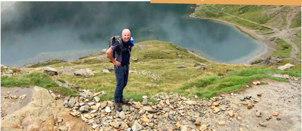
Dad climbing Mount Snowdon in 2021

As Dad was incredibly immunosuppressed, COVID-19 only exacerbated my anxiety, revealing how much I needed to speak to someone.